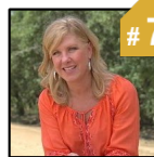
MY HUSBAND'S NUTS