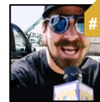
420 KINGDOM DELIVERIES